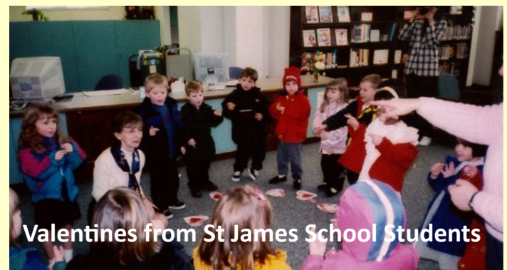
Valentines from St James School Students