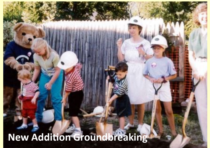
New Addition Groundbreaking