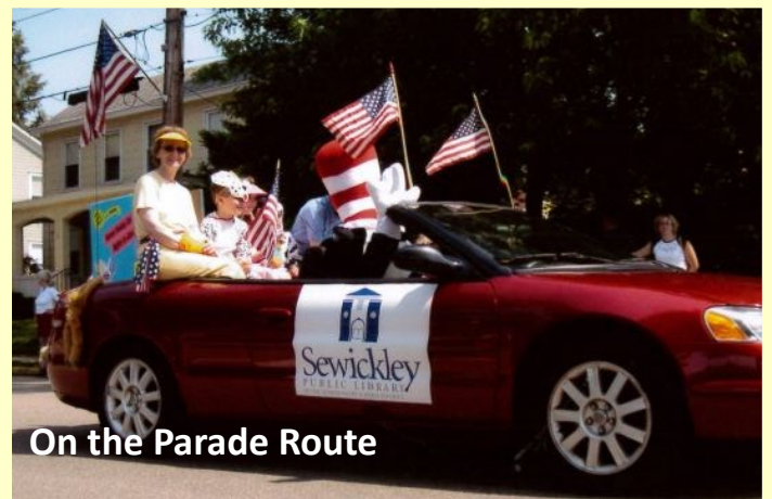
On the Parade Route