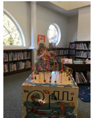
A new game in the Children's Department