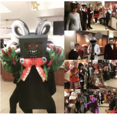
Scenes from SWAGOWEEN IV