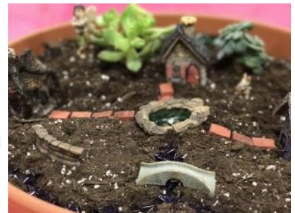
A Fairy Garden